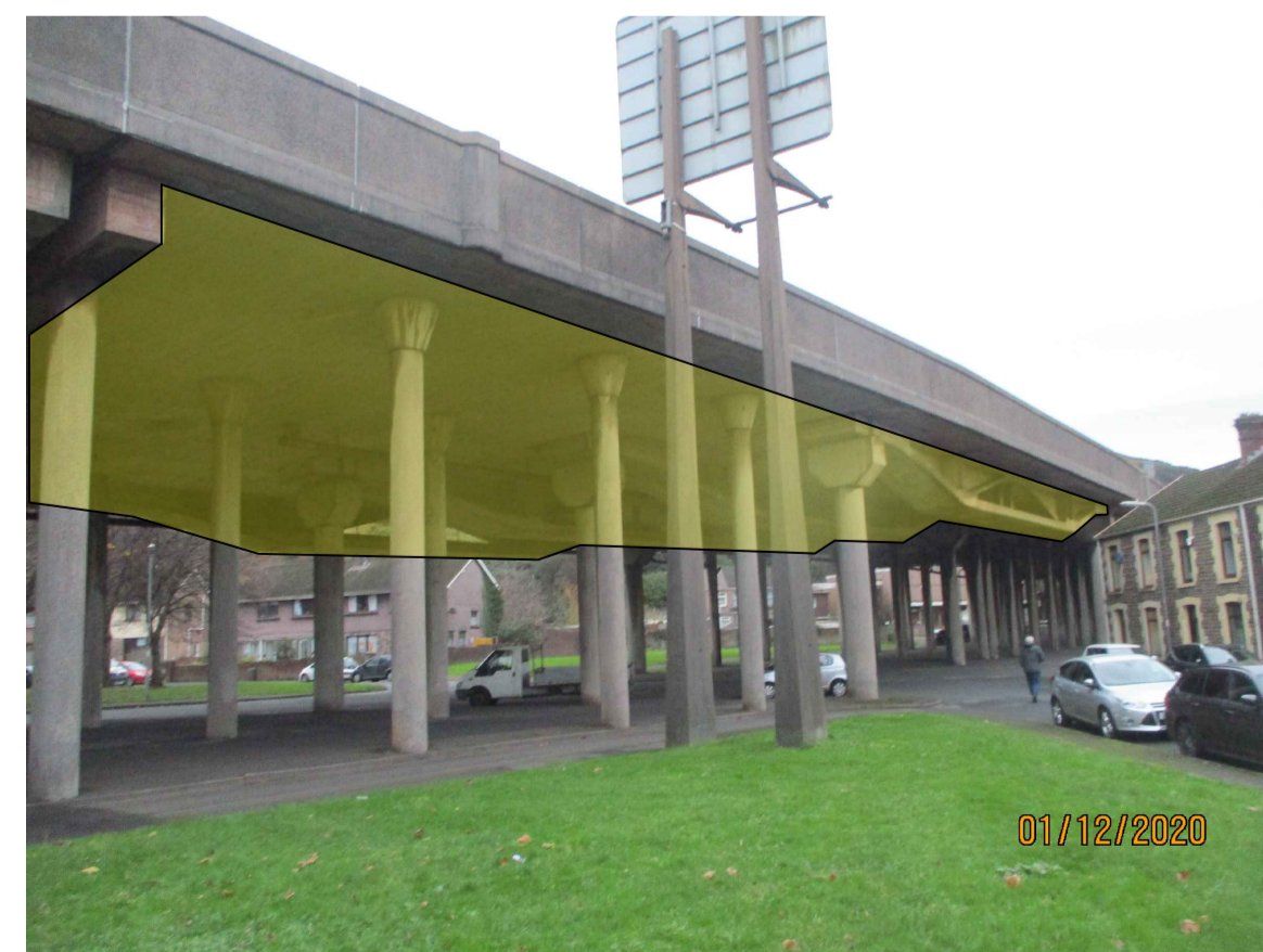
FIGURE 3: GENERAL VIEW OF SPAN 4 WITH PROPOSED NETTING.