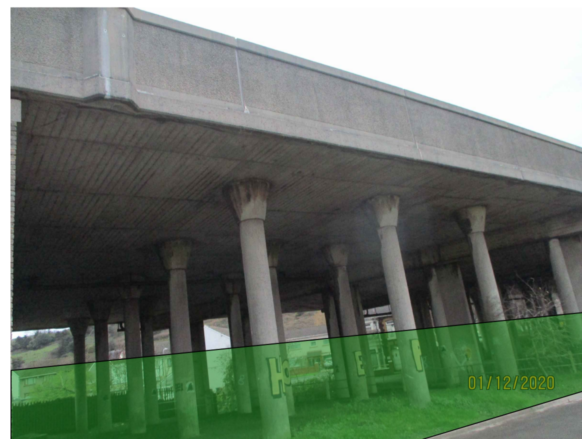
FIGURE 2: GENERAL VIEW OF SPAN 1 WITH PROPOSED FENCING.