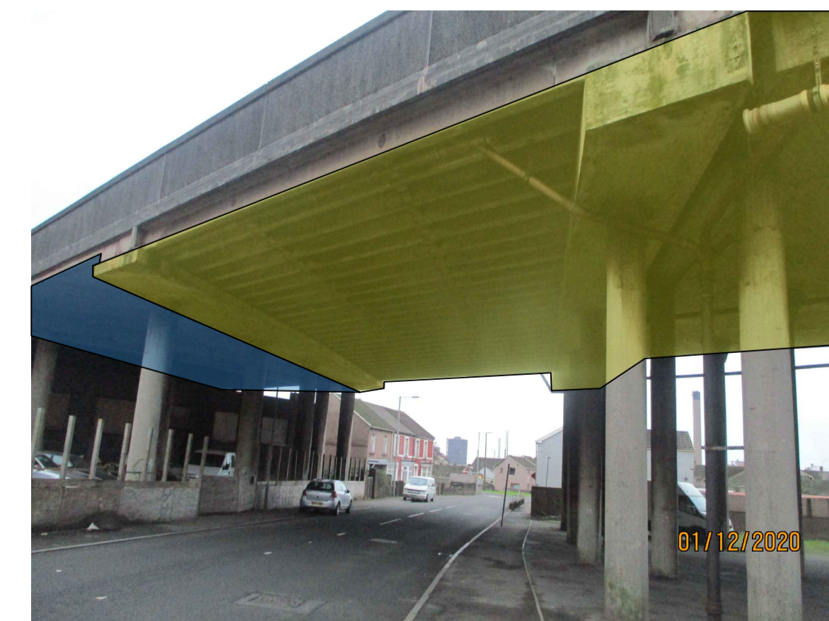
FIGURE 4: GENERAL VIEW OF SPAN 7 WITH PROPOSED NETTING.