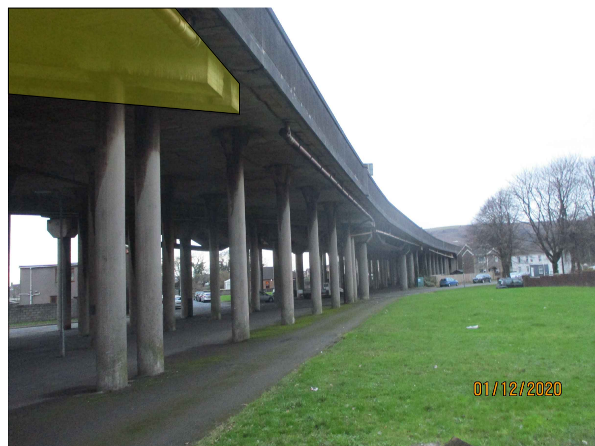
FIGURE 1: GENERAL VIEW OF NORTH ELEVATION.